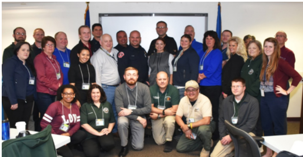
CERT Train-the-Trainer participants.