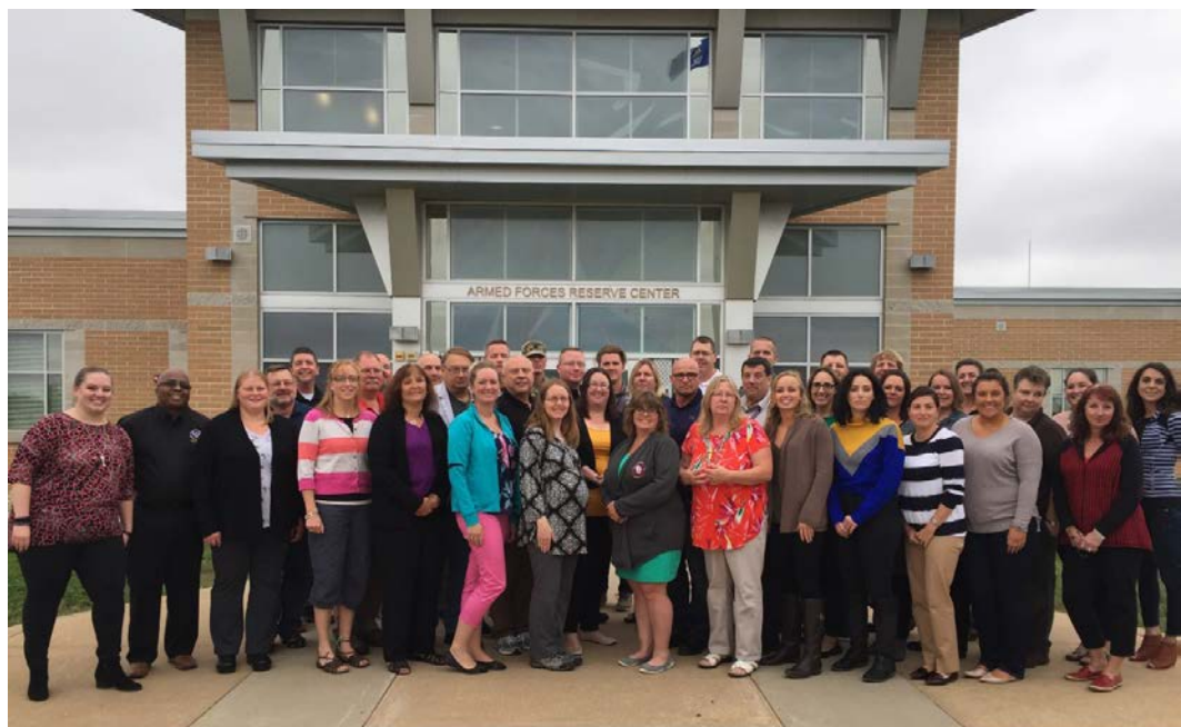
Students from the Wisconsin-based MEPP courses.

After taking a few years off from local deliveries, the IEMB took MEPP on the road to Wisconsin. Supported by the state EOC, the National Guard, and a local community college, course 0132 ( Exercise Foundations, Program Management, Design and Development ) and course 0133 ( Exercise Conduct, Evaluation and Improvement Planning ) were successfully delivered. Each of these courses took place over 4 days and had 40 students attending.