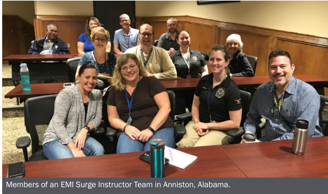
Members of an EMI Surge Instructor Team in Anniston, Alabama.