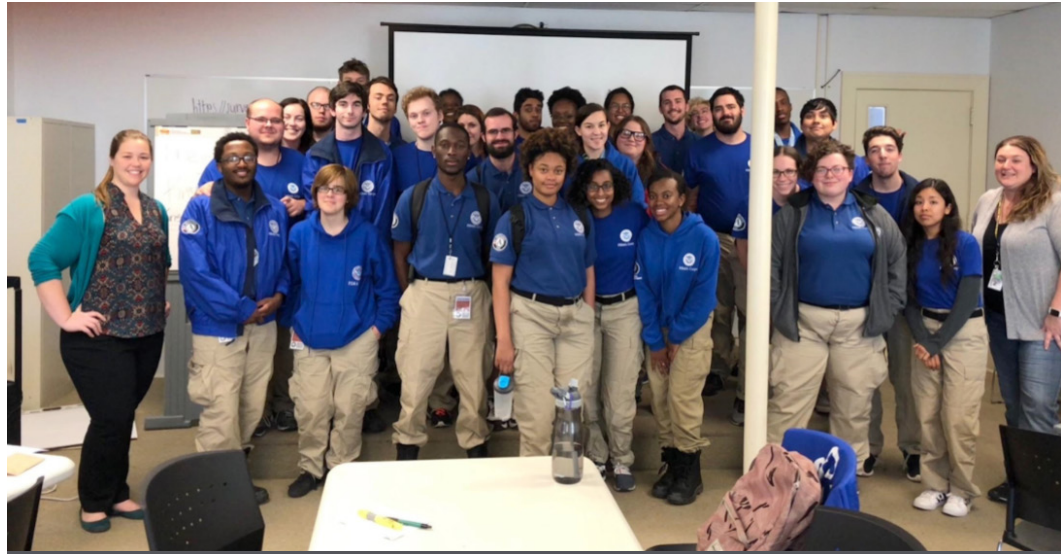
FEMA Corps members with EMI staff during training in Vicksburg, Mississippi.