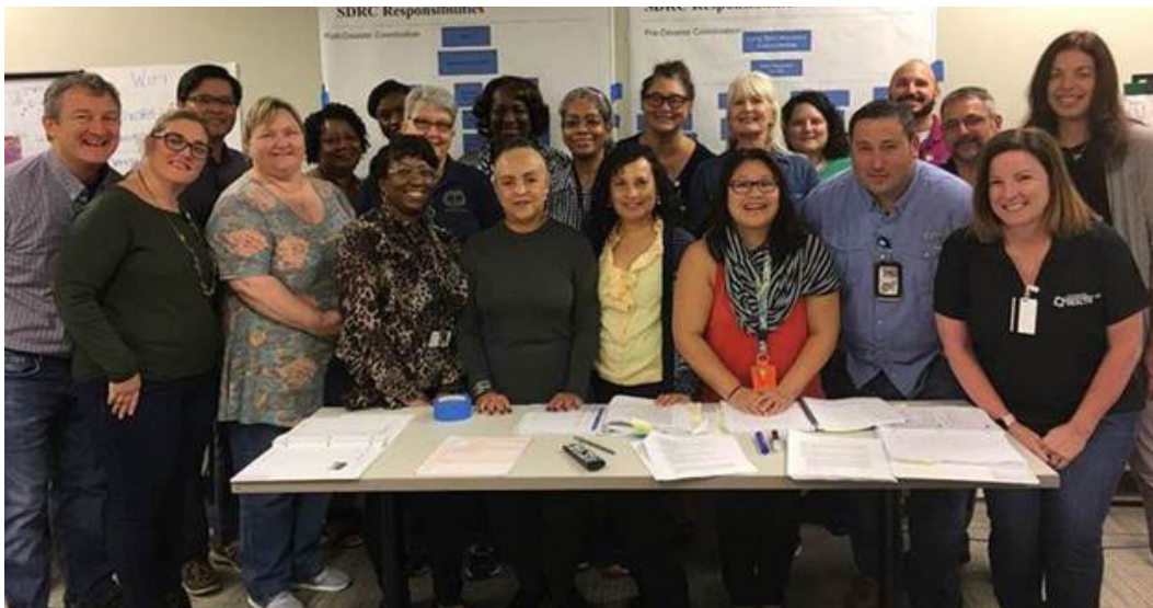
Participants from the Louisiana State Recovery Planning and Coordination course.

Louisiana’s Office of Community Development, Department of Children and Family Services, Louisiana Housing Authority, and the Department of Transportation and Development were just some of the agencies represented in the course. Participants stated that they appreciated that the instructors worked to tailor the content to meet their state’s needs as well as appreciated the diverse experience the instructors brought with them. One official noted that, “Louisiana has had to recover from numerous disasters, so this is not a new concept, but that writing down what they had done would be crucial for the future.”