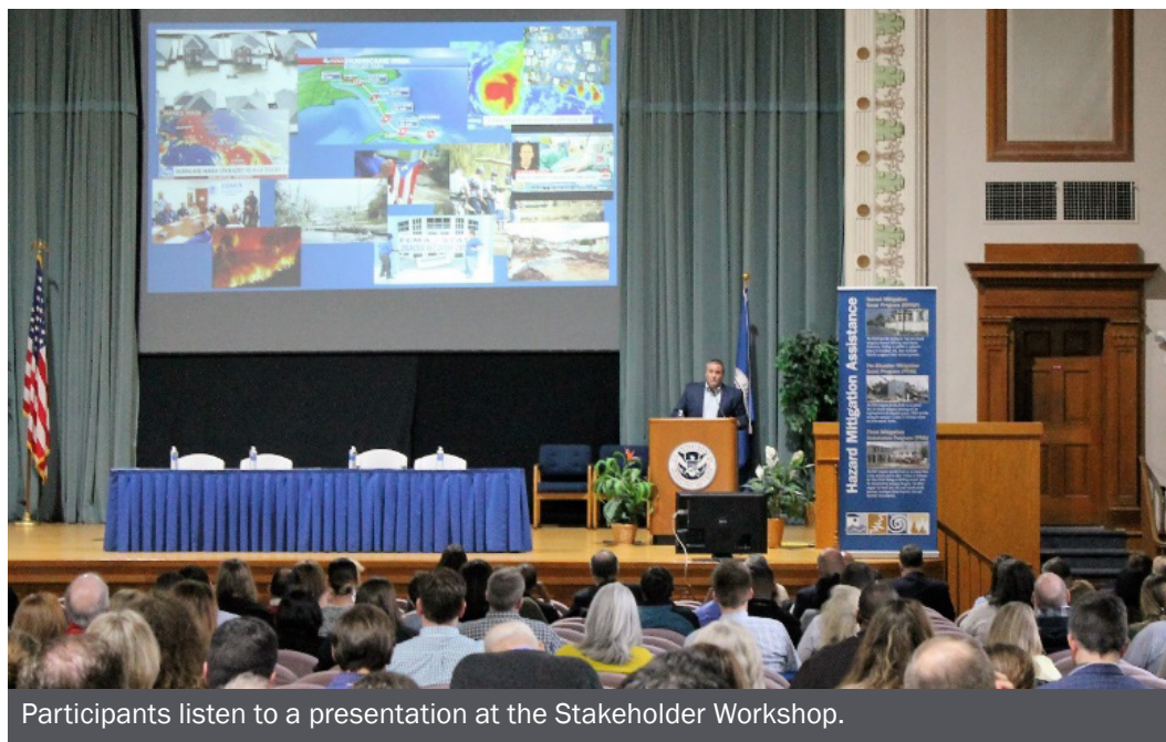
Participants listen to a presentation at the Stakeholder Workshop.

This workshop provided a valuable and impactful opportunity for federal and SLTT officials to come together to advance their mitigation opportunities and promote floodplain management, all while adding value to existing partnerships, forging new strategic relationships, and enhancing HMA credibility. All of these activities are critical to reducing risks from hazards nationwide.