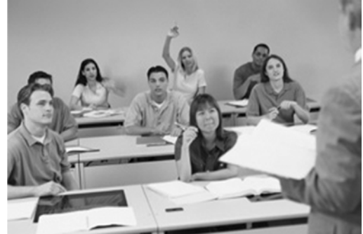
Develop a training program for emergency management personnel.

Developing a training program for emergency management personnel including a program of tests and exercises, is one of your important functions.