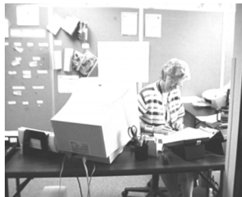
The administrative staff handle the routine office work.

The administrative staff handle the routine office work. You may not be able to run an emergency management office without some type of administrative help. A good administrative assistant handles paperwork effectively and efficiently. Among other important duties, someone needs to answer the phone, check the e-mail, log and track mail, and process reports and data coming in from the other offices. Every emergency management office should have administrative support staff, if only on a part-time basis.