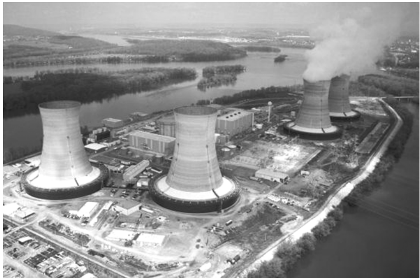
Examine your community for new hazards.

Examine your community for new hazards. For example, was a nuclear power plant put into operation recently? It may not have been a previous hazard, but now it will require some modifications to your plan along with some community education. Factor these costs in as much as you can.