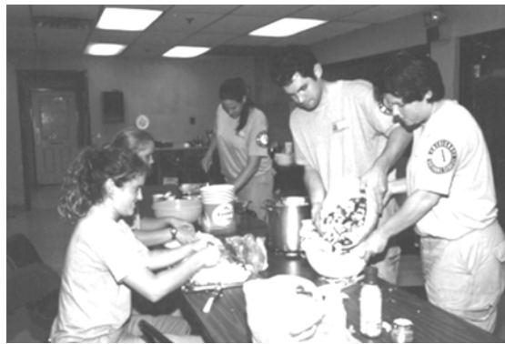
The emergency personnel staff the EOC as needed.

Depending upon the local community, paid personnel or volunteers will be used. Regardless, it is absolutely essential that your emergency plan spell out the staffing of your EOC and the responsibilities of each person. This is especially critical if the staff does not function in the EOC on a day-to-day basis. When the officials activate your EOC, the staff will need a reminder about their responsibilities. Standard operating procedures (SOPs) can be helpful to remind people about what to do during an emergency.