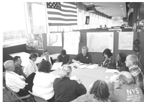
Meetings can be a form of instruction.

Often an excellent way to instruct without seeming to is to organize and run a meeting that has a specific outcome.